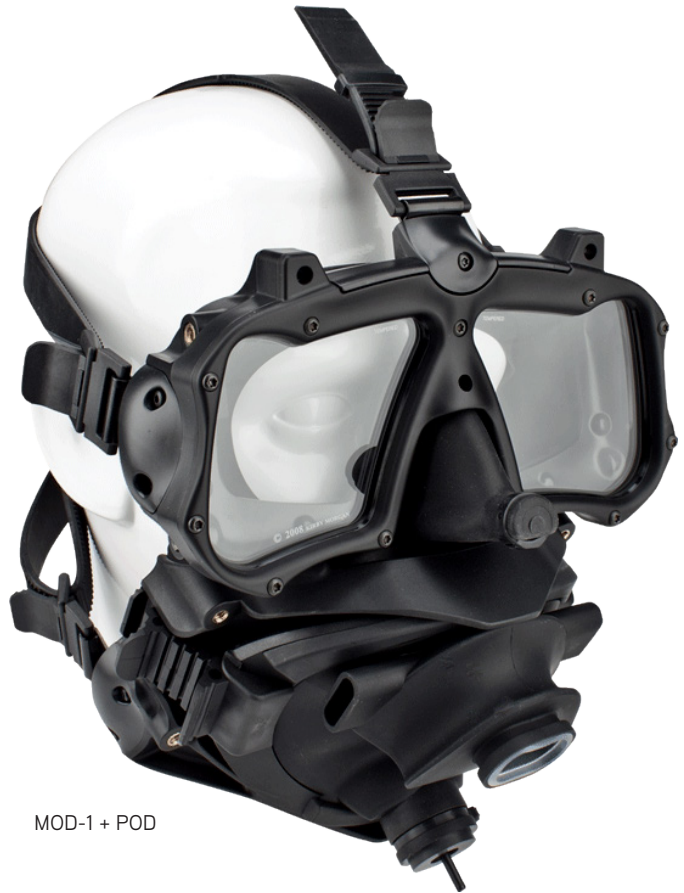
MOD-1 + POD

Hollis is excited to partner with Kirby Morgan Dive Systems, Inc, the pre-eminent designer of commercial and military diving systems, to bring our divers a product, the MOD-1 with Hollis BOV POD, which will expand possibilities in diving safety, reliability, and versatility.