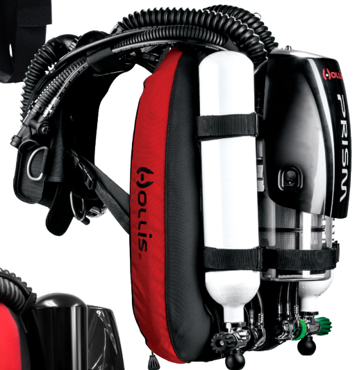
Front-Mounted Counter Lung