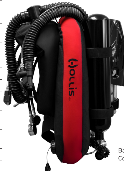
Back-Mounted Counter Lung