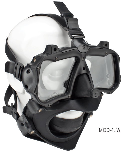
MOD-1, W/O POD