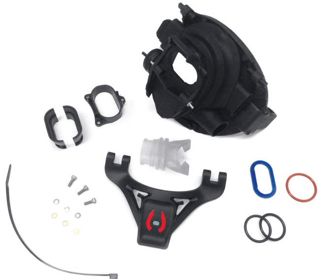
MOD-1, HOLLIS BOV POD ONLY