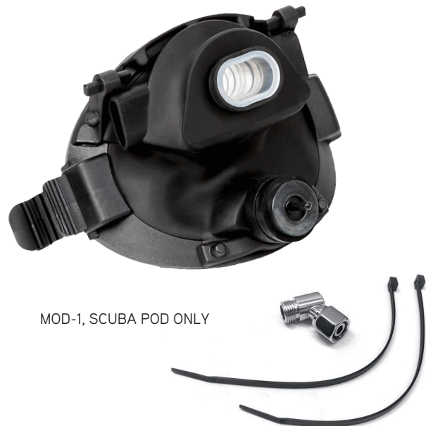
MOD-1, SCUBA POD ONLY

The MOD-1 communications system is sold by third party organizations. Please contact your Sales Representative for more information.